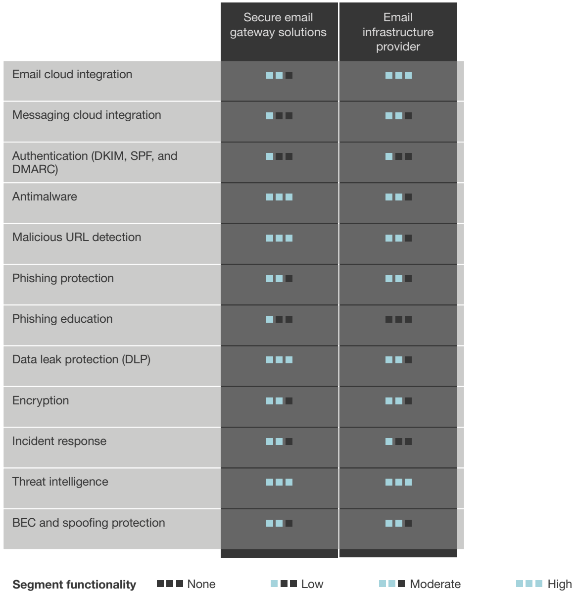
FIGURE 2 Now Tech Functionality Segments: Enterprise Email Security Providers, Q3 2020, Part 1